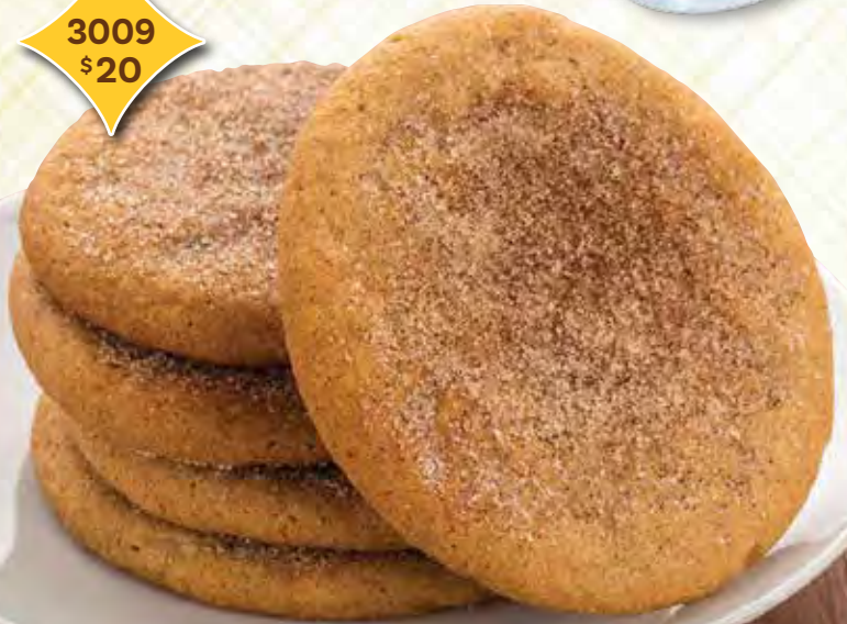
White Chocolate Macadamia