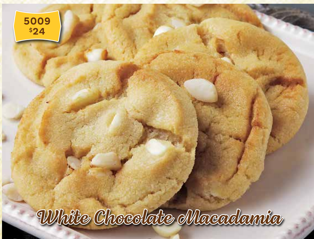
White Chocolate Macadamia